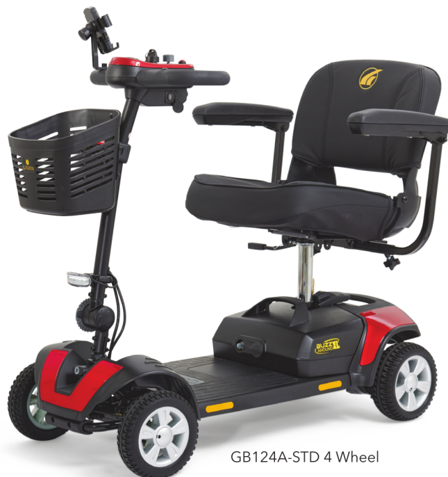
GB124A-STD 4 Wheel