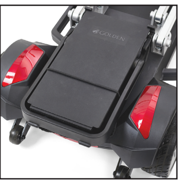
Optional spare battery storage in rear basket