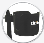
Cup Holder Item #STDSI040S