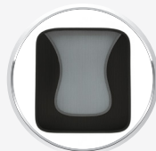
Gray Cushions, 18" Item #AEROFly-06-18 (Back) Item #AEROFly-28-18 (Seat)