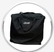
Carrying Bag Item #AFCARRYBAG