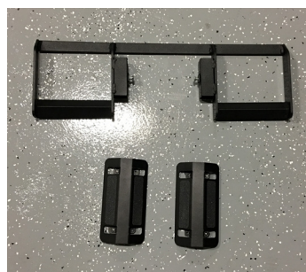
Adjustable 4 Wheel Cradle Kit