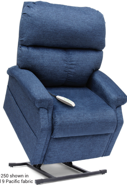
LC-250 shown in Cloud 9 Pacific fabric